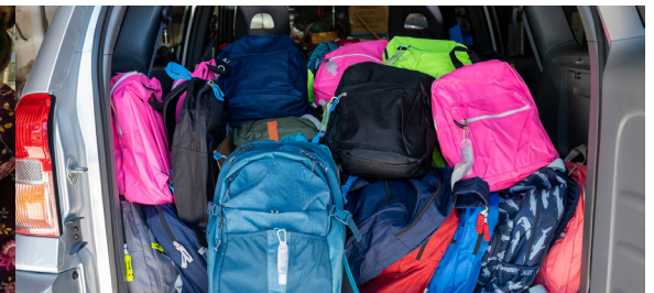
Back-To-School Backpack Donation