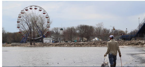
Fox-Wolf Watershed Cleanup