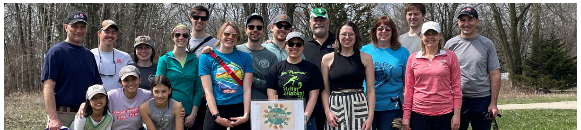
Earth Day Cleanup