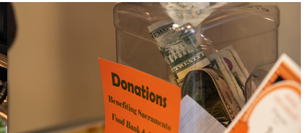
Chili Cook-Off to benefit STEM education